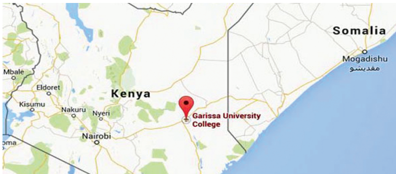
Fig. no. 1. A map showing Garissa University College in northeastern Kenya. Gunmen attacked the institution on April 2, 2015.

and cultural reasons a terrorist cell might target learning institutions. And this is where such acts diverge from the usual modes of modern terror [35].