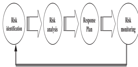
Fig. 1 Cycle of risk management process

Any project, small or complex, needs special attention to risk management [1]. A risk management strategy must be developed, first to identify as many potential risks as possible and then to decide how to deal with them ( Fig.1 ).